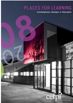
2007 and 2008 Awards book