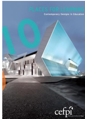
2009 and 2010 Awards book