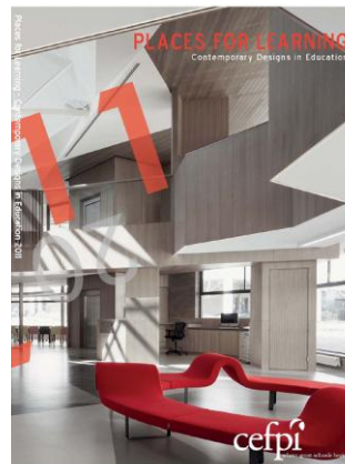
2011 Awards book